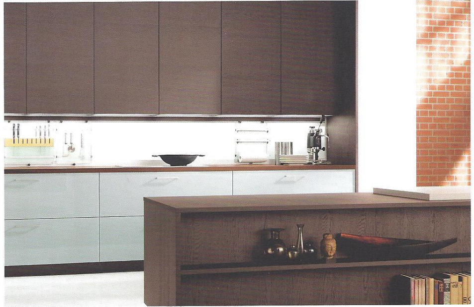
Invizilite Generation 2 by CSL® Creative Systems Lighting

Task Master: Use adjustable recessed fixtures with bright and crisp halogen sources. Add decorative pendants above a kitchen island or linear surface lighting (kitchen under cabinet or interior cabinet lighting). In the bath, make sure to install bathroom sconces or bath bars that light up faces well. Articulating reading lamps and directional desk lamps are also important for layering.