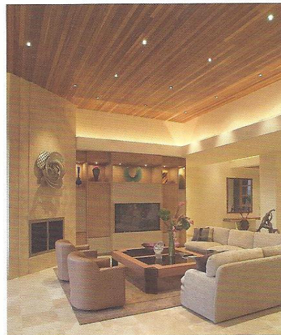
Eco Downlight by CSL® Creative Systems Lighting